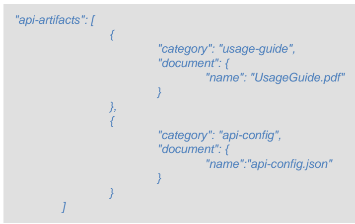
Create Semantics: Optional.

Update Semantics: Optional. If the property is not specified the API artifacts will not be modified. Specifying an artifact in the api-artifacts array that has no document property will cause an existing document with matching category to be removed.