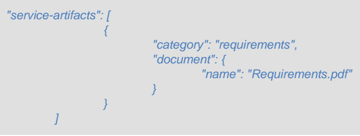
Create Semantics: Optional.

Update Semantics: Optional. If the property is not specified the Service artifacts will not be modified. Specifying an artifact in the service-artifacts array that has no document property will cause an existing document with matching category to be removed.