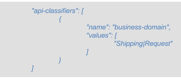
Create Semantics: Optional.

Update Semantics: Optional. If the property is not specified the classifiers will not be modified. Specifying a classifier in the api-classifiers array that has no values will cause existing values for the classifier to be removed.